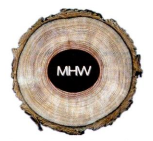
Milwaukie Hardwoods, LLC