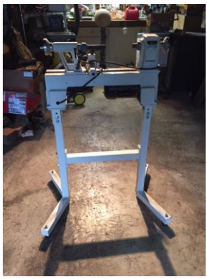
FOR SALE: The Pacific North West Guild has a Jet lathe for sale