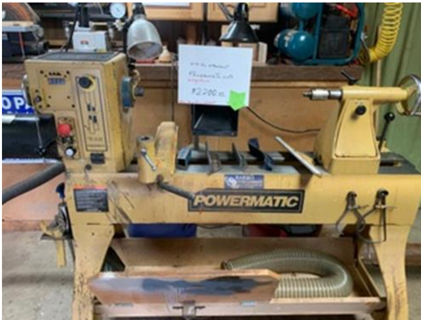
The lathe a Powermatic 3520B with and attached vacuum for $2200.00

Well, where do I start? I am hoping this finds you all well with all that we have been undergoing. What a time, Huh? Well, I have hung up my gouges and must call it quits, just can't do it anymore. Therefore I am putting up for sale, and at good prices, my collection of turning tools and machinery. I wish to offer them for sale to any of the members of the Turning Club I am very fond of, " Cascade Woodturners".