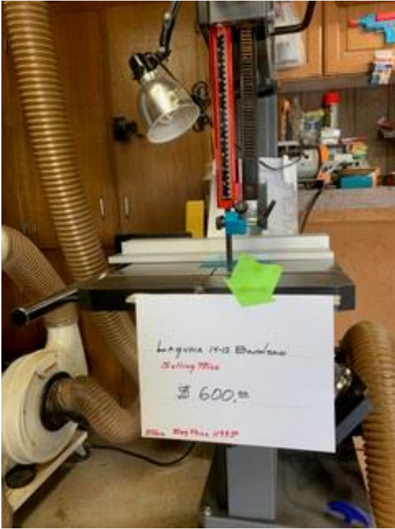
A Laguna 14/12 bandsaw for $600.00