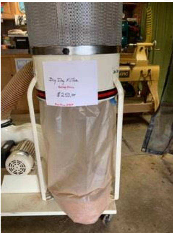
Jet Dust Collector For $250.00