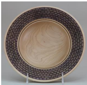
A few examples of Eli's work

If you are interested in signing up for one of the classes contact Dale at 503-661-7793 or at woodbowl@frontier.com.