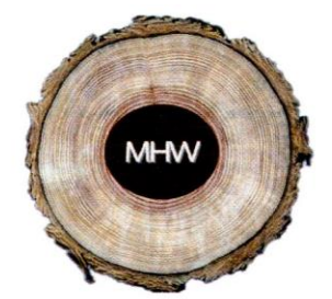
Milwaukie Hardwoods, LLC