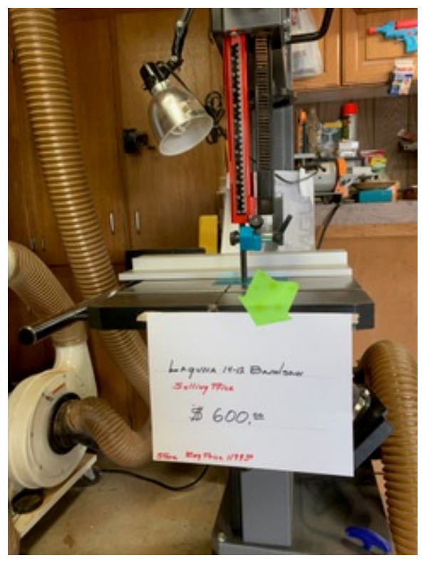
A Laguna 14/12 bandsaw for $600.00