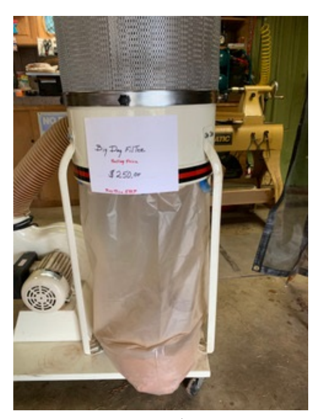
Jet Dust Collector For $250.00