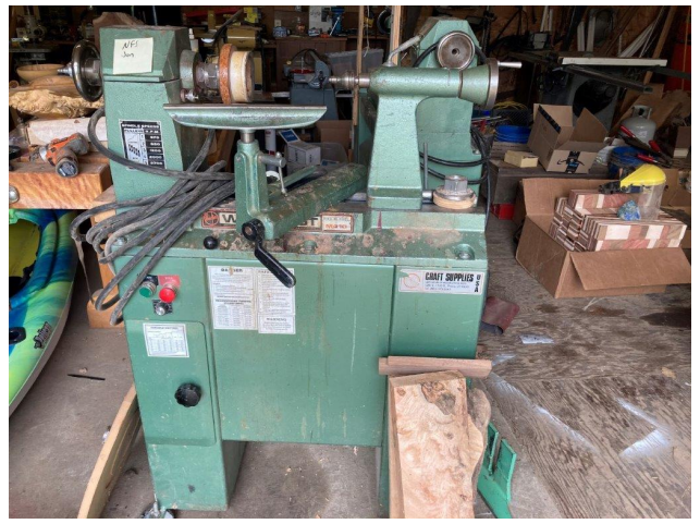
Woodfast lathe model m910 $2000