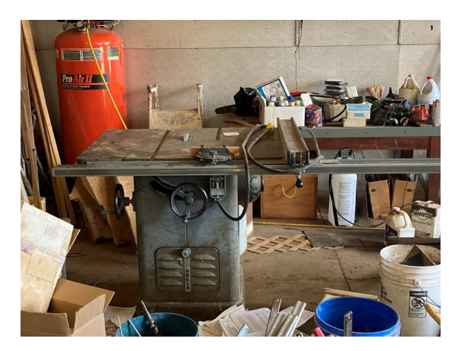
Rockwell Delta router table model 43-502 $250