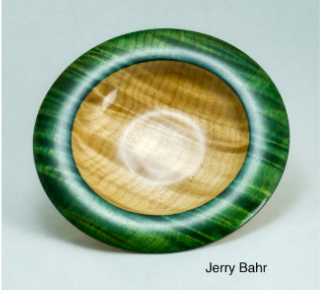
To get a better view click here!