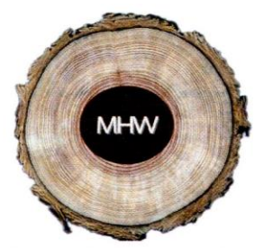
Milwaukie Hardwoods, LLC