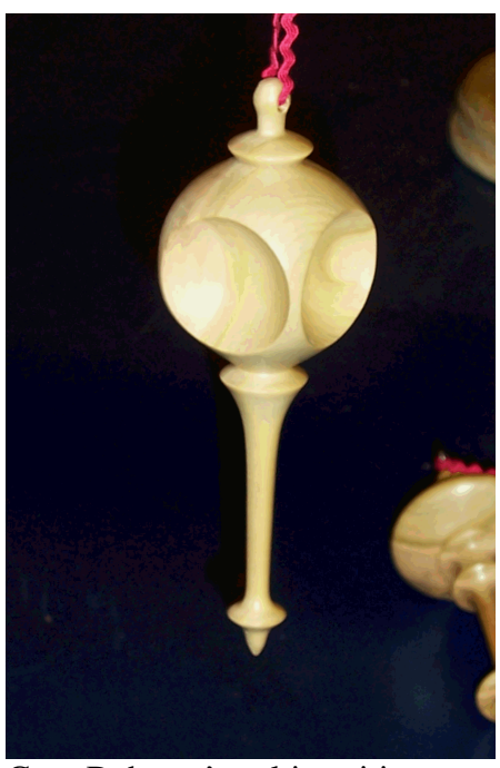
Gary Dahrens' multi position turned ornament