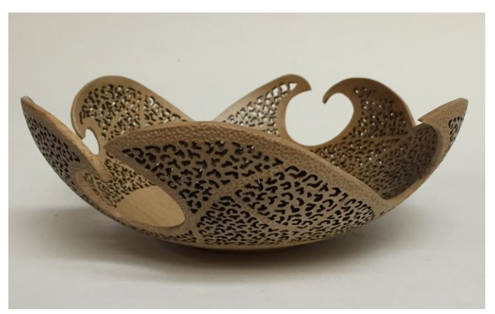
Pierced dish by Kathleen Duncan

Opening Reception: Friday, March 4, 5—7 PM Gallery Hours: Tues-Fri, 11 AM—4 PM 510 Museum & ARTspace 510 1st Street Lake Oswego, OR 97034 Organized and curated by the