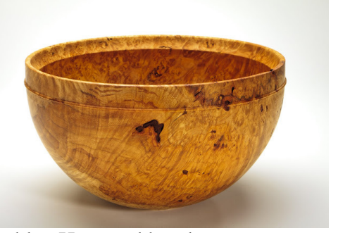
Ashley Harwood bowl <a href="http://www.ashleyharwood.net">http://www.ashleyharwood.net</a>