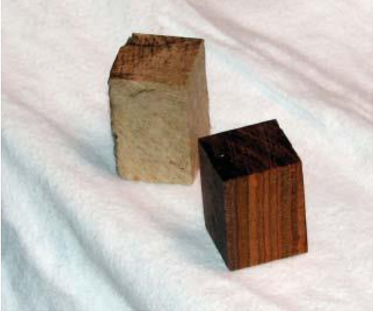
Samples of stock to be used.

This quick project makes a useful item that everyone seems to need. I begin by purchasing rare earth magnets. The most useful size is just under 1/2 inch diameter (12 mm) and 1/8 inch thick. These can be ordered from most supply catalogs, but I get mine from my local craft supply store. They are about 1/2 the price as the mail order sources, and the magnet is the major cost in making this project.