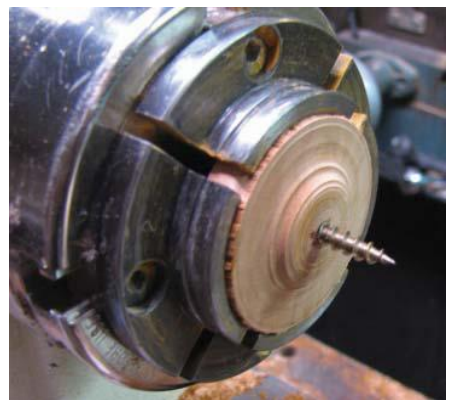
Homemade screw chuck to hold the blank for turning.

Make a screw center for your lathe that is appropriately sized for this project. I take a scrap of wood that fits into my chuck and true its face. I then drill clear through the piece at its center with a 5/32 drill. Remove this blank from the chuck and countersink the backside of the hole so that a #12 flat head screw will seat firmly. I typically use a 1" by #12. You may need to deepen the countersink so that ½ to 5/8 of an inch of the screw protrudes through the front of the blank. I then put epoxy on the head to hold the screw in place.