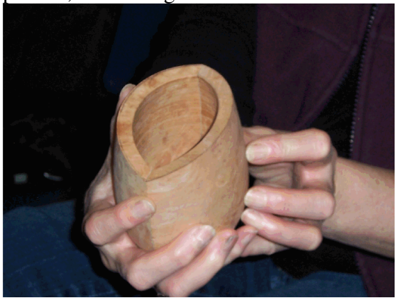
By varying the outside curve and the size of the removable center support, the final shape can be almond shaped open vase like or a closed pod. The design is up to your imagination.

After turning and removing the center portion, the turning looks like: