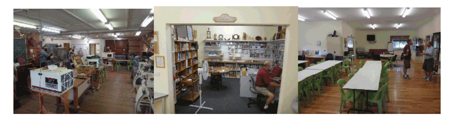
35 years of woodturning.

presses, bandsaws and a great dust system. About one third of the building is their demonstration area/lunch room/library. They have their demo lathe up about a foot on a stage with two remote controlled cameras hanging from the ceiling covering the demo lathe. The building is open 4-5 days a week and evenings. These buildings are called "man sheds" in Australia and are apparently fairly common for different hobby groups. I'm telling you we have to find something like this.