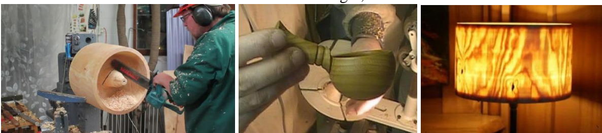
Soren turning lamp shade

June 18<sup>th</sup> – 20<sup>th</sup> – Cascade Woodturners - Soren Berger, Demo & Class