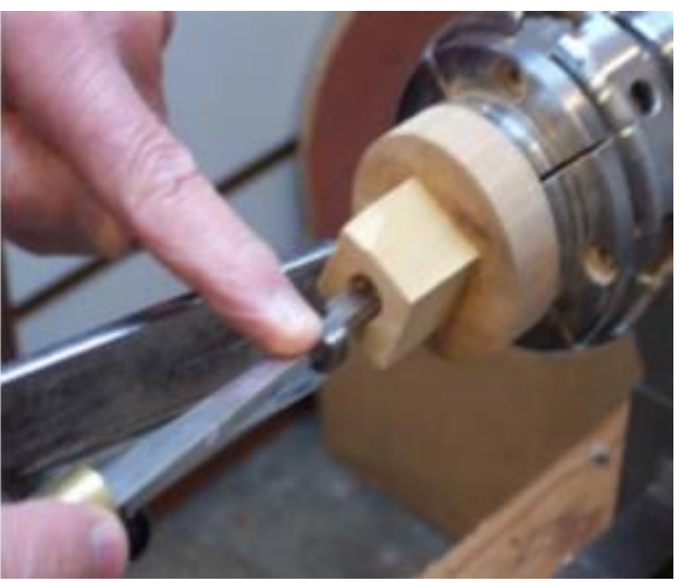
Threading the hole in the lid with the inside chasers.