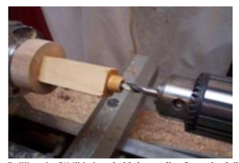
Drilling the 5/16" hole to hold the needles. It can be drilled before or after threading.

Drill a 7/16" hole in the lid section that is about 1/2" deep. Then round over the front edge of the hole and cut a recess in the bottom of the hole to allow the chaser to cut a clean thread before it would hit the bottom of the hole. When the threads are satisfactory, you are ready to mount the base section for drilling and threading of the tenon that will be threaded.