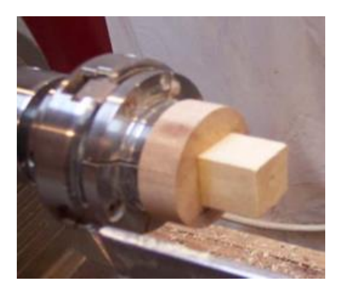
The lid is ready to drill with a 7/16" drill to a depth of about 1/2".