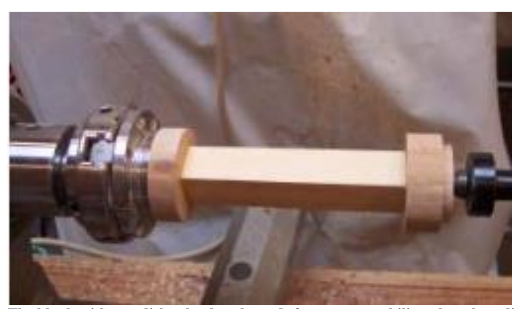
The blank with two disks glued to the ends for greater stability when threading.

When I started to make one of these, I tried to use the Nova chuck with the 25mm jaws to hold the pieces while threading. This worked fine for the lid, but I had troubles with the wood moving in the chuck when trying to chase the outside threads for the body of the case. I solved this problem by turning tenons on each end of the blank and gluing on a two inch disk to be grabbed in the 50mm jaws of the Nova chuck as shown below.