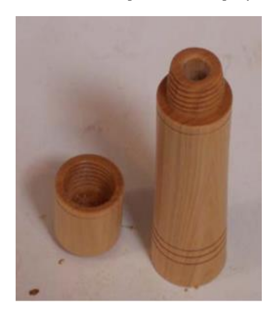
The finished needle case with the lid removed.

If you don't have any boxwood or other hard, dense woods, you have two other options. You can use material such as Corian, which threads very well. Or you can cut recesses in both the top and base sections and pour it full of epoxy.