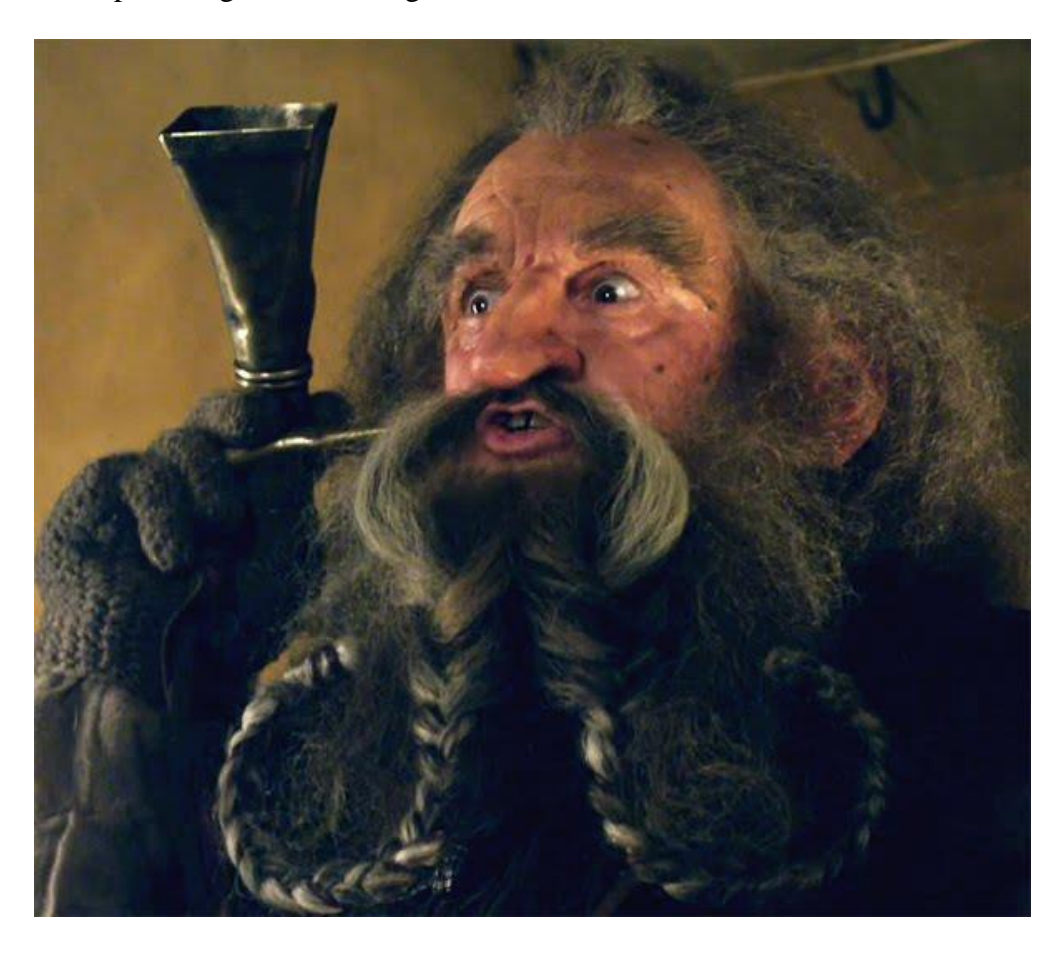
Oin the woodturning dwarf from "The Hobbit."

The worst option is skip hearing protection altogether. But the advantage of that option is that you could end up looking like a dashing movie character: